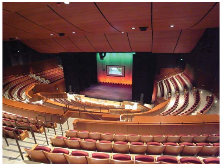
Inside the Hall: Semi Proscenium Configuration