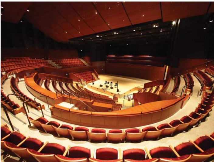
Inside the Hall: Thrust Configuration