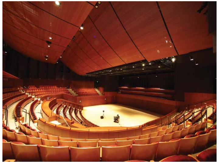
Inside the Hall: Concert Configuration