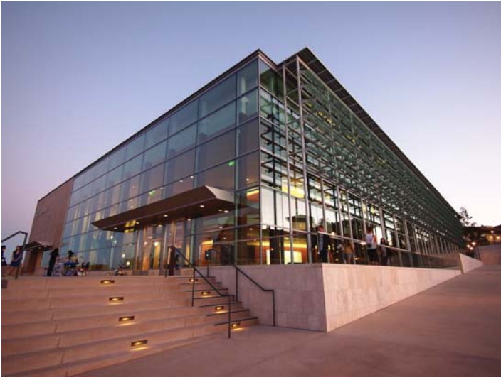
Soka University Performing Arts Center