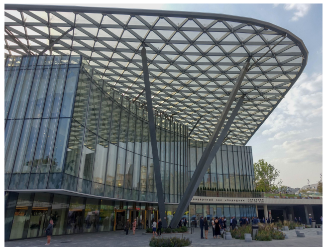
Figure 1: Building Exterior (Main Entrance)

Designed primarily as a hall for orchestra performances in natural acoustics, the Large Hall features a stage sized for large ensembles, complete with mechanical risers. The audience is divided between an extensive main parterre section and a seating terrace to the sides and back of the stage which transforms into a balcony as it steepens toward the rear of the hall. Additional shallow balconies on each side of the hall are primarily used for VIP guests. The first rows of the parterre are laid out