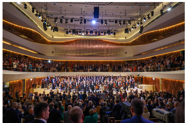
Figure 5: Inaugural Concert

Maestro Valery Gergiev gathered a small group of musicians from Mariinsky Orchestra on August 29, 2018 as their first rehearsal in the finished hall ahead of the inaugural performance. The musicians immediately sounded at ease on the new stage, and Maestro Gergiev quickly stepped off the podium to walk around the hall, conducting the ensemble from a distance and instructing changes in the music and musicians' layout. Together, they playfully explored various musical registers and seating arrangements, putting the hall and its acoustics through a thorough test. They were later joined on stage by pianist Denis Matsuev. The sound in the hall was consistently clear, balancing great warmth and precision while exhibiting strength and richness throughout the audience.