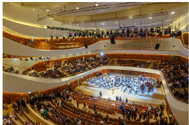
Figure 2: Large Hall (Balcony View)